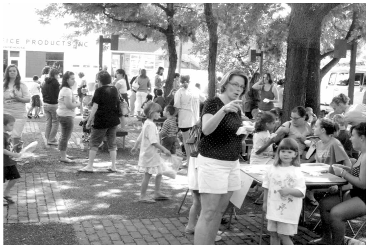
The park behind the library is a great place for families to have fun.