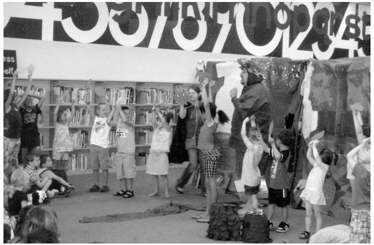
Enchanted Forest with Carnegie Museum of Natural History.