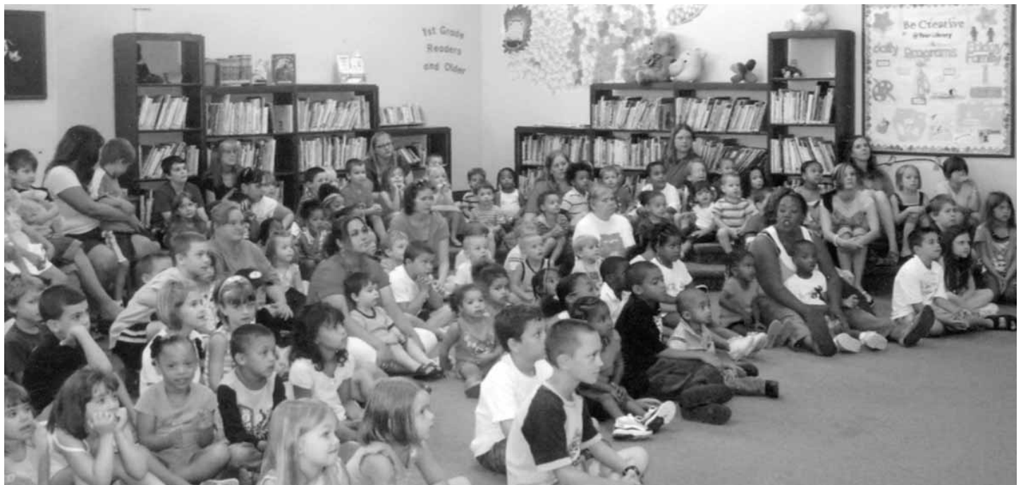
Families gather for Summer Reading activities.