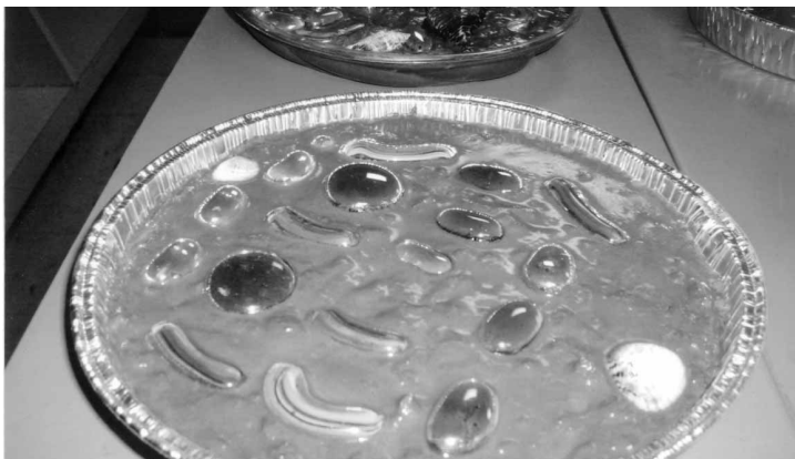
Stepping Stones for the garden