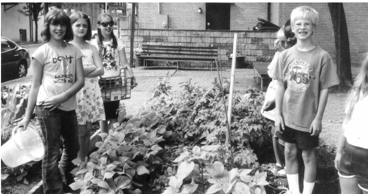
Gardening Club picking beans